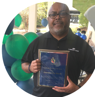
Community Bank Corporate Partner of the Year

Thank you to the W.K. Kellogg Foundation, Dave Thomas Foundation for Adoption, Wendy's (Carlisle Corporation & Perimeter Foods), Mississippi Department of Health, and Community Bank for their continued support of our fundraising events and outreach opportunities.